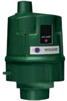
WATCHMAN SENSOR DEVICE

You'll receive regular updates about tank levels and usage across your business, we can update you daily or weekly and in a range of formats - from smartphone to text alerts. The choice is yours.